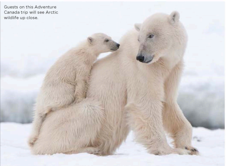
Guests on this Adventure Canada trip will see Arctic wildlife up close.

Experience the expansive beauty of polar fjords and islands on Adventure Canada's Heart of the Arctic itinerary, which departs July 17. Cruisers onboard the 198-passenger Ocean Endeavor will travel from Canada's Inuit regions of Nunavik and Nunavut to Greenland, stopping to hike serene islands and glaciers, learn about regional customs and observe endemic wildlife, from polar bears and musk oxen to walrus and humpback whales. In Nuuk, Greenland's capital, the group will see the famous Qilakitsoq mummies, which date back to 1460. Before the journey ends, guests will cruise on Zodiacs to see a glacier on western Greenland's longest fjord. The trip begins at $3,955 per person. ( www.adventurecanada.com ) — C.L.