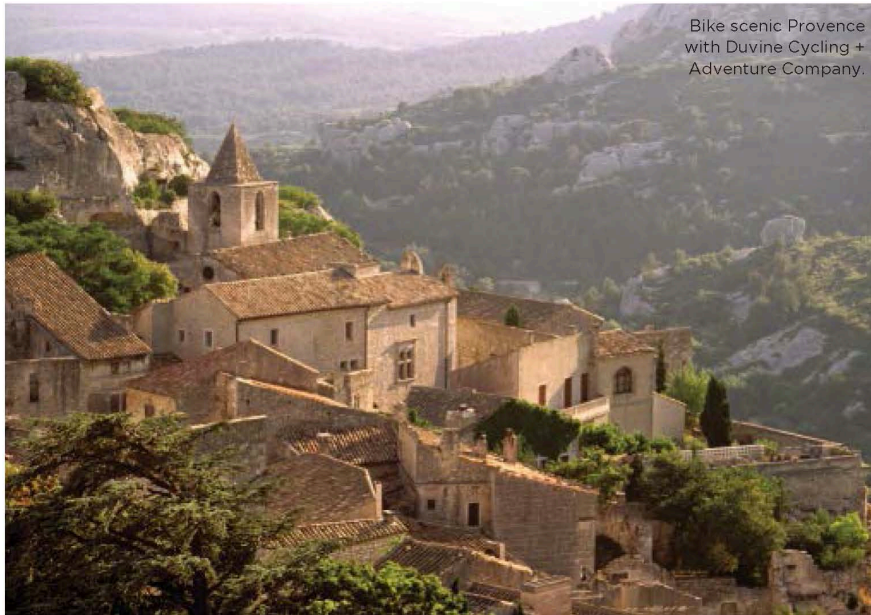
Bike scenic Provence with Duvine Cycling + Adventure Company.

To get a real sense of the French countryside, hop on a bicycle and let Duvine Cycling + Adventure Company be your guide. Travelers on the Provence Bike Tour will pedal through lavender fields, cherry orchards and vineyards en route to medieval sights and villages. The group will cover between 16 and 37 miles daily, but not without sampling regional fare and wines along the way, including picholine olives, goat cheese and slow-cooked lamb. Riders also have the option to put their strength to the test on day three of the journey, when a guide will take willing participants up Mont Ventoux, known as one of the more challenging segments of the Tour de France. The six-day itinerary starts at $5,495 and departs several times in April, May and June. ( www.duvine.com ) — C.L.